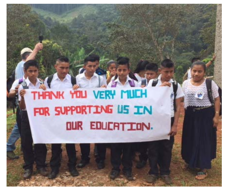
Students at Semuy Middle School are constant and clever with their gratitude for TEACH support.

extended bv five weeks. into early December, to make up for missed weeks in the spring. Many students at the primary, middle and high school levels are finishing up terms and eager to continue their education. А young woman at Sacred Heart Boarding tells us "I have grown up and learned many good things here. This