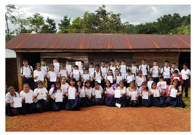
Semuy Basico Middle School students hold up letters from their St. Ambrose Catholic School pen pals in Virginia.