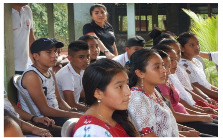
Middle schoolers' faces show hope, wonder, excitement, eagerness, and inquisitiveness. I only hope their desired futures come true.

I came across this quote by Ryunosuke Satoro recently and realized it applies to TEACH . The news from the border can be overwhelming.