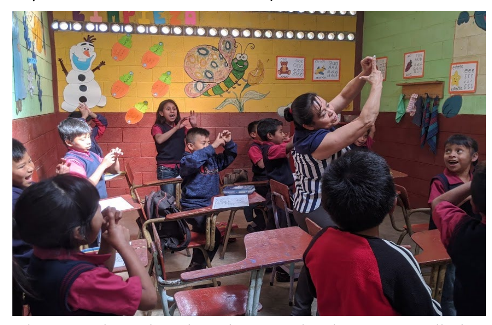
This pre-pandemic photo shows there is much enthusiasm at Semilla de Esperanza. Nowadays most school lessons are completed at home.

many ways for several years, such as giving the children psychological support, improvements to the building, and salaries for teachers and the cook.